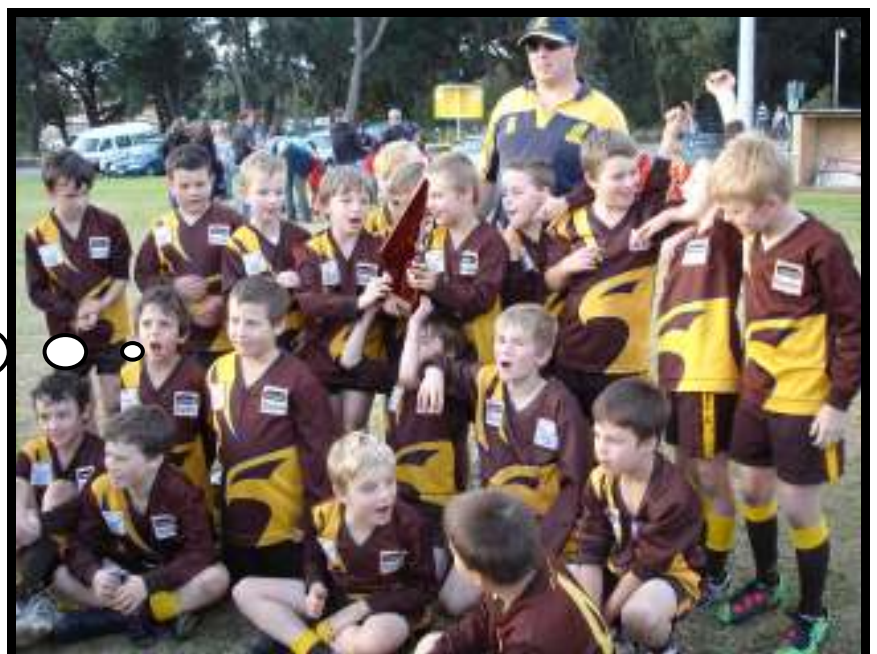
Printed Courtesy of JDS PRINTING